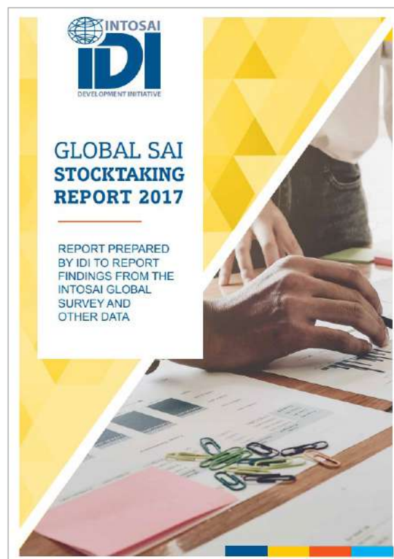
The latest Global SAI Stocking Report from 2017

The Global Stocktaking Report provides a benchmark which can be used to monitor developments at the regional and global level with regards to SAI governance and SAI independence. The next Global Stocking Report will be published in 2021.